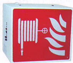
Single Faces Fire Host