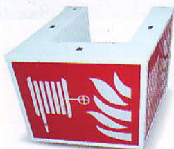
3 Faces Fire Host