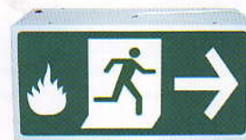
Extra Width Fire Exit Light

Note : Special Order Sign Light available upon request