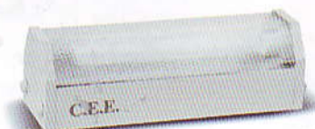
PLL LAMP 18/24/36W