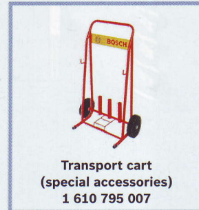
Transport cart (special accessories) 1 610 795 007